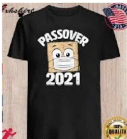
Happy and Healthy Passover to everyone!